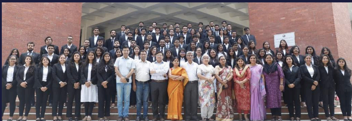
Batch of 2015-20