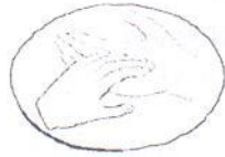
Step 5. Wash fingertips.