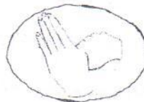
Step 4. Wash thumbs.