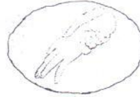
Step 6. Wash wrists.