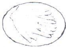
Step 1. Wash palms and fingers.