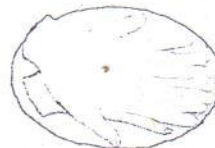
Step 2. Wash back of hands.